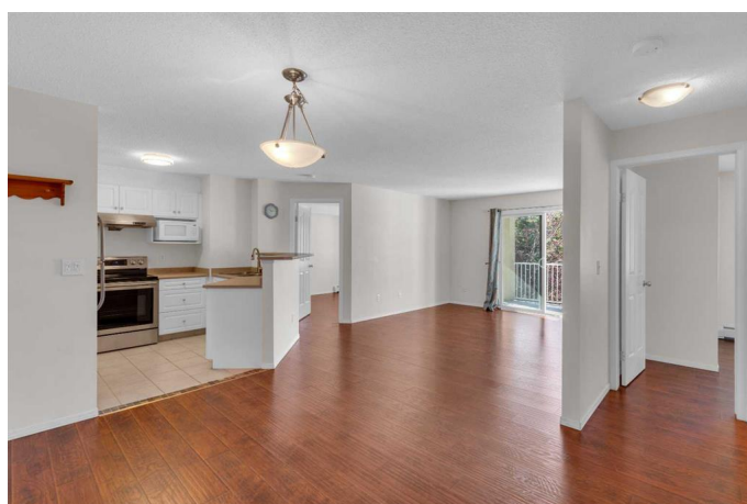
312-3000 Citadel Meadow Point NW, Calgary, AB