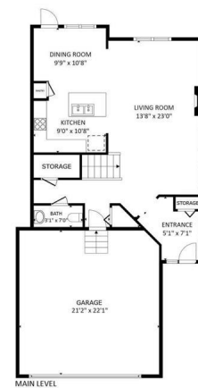
119 Cimarron Vista Crescent - Okotoks MAIN LEVEL: 813.5 SqFt, GARAGE: 491.5 SqFt