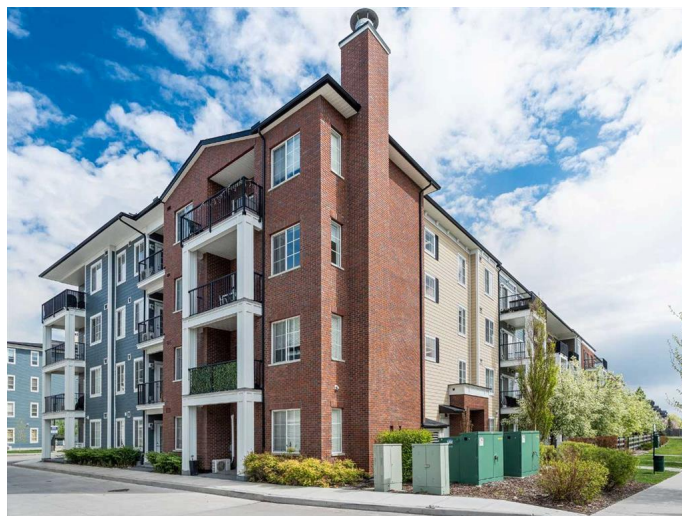
7309-151 Legacy Main St SE, Calgary, AB