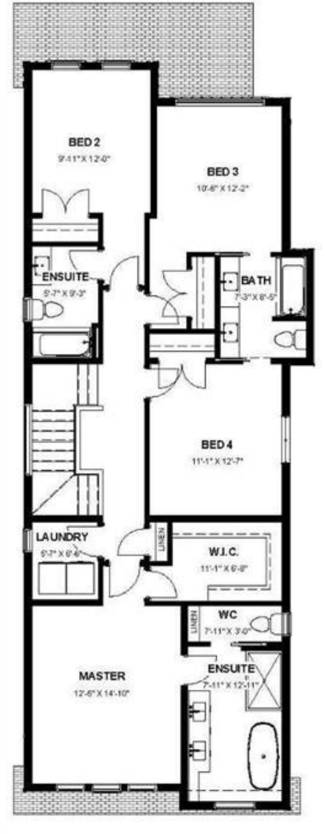
SECOND 1,245 SQ.FT. (4 BEDROOM OPTION)

Listing Office Real Estate Professionals Inc.